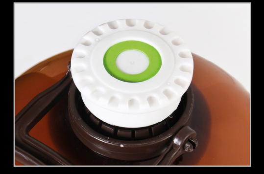
Connector type A (iron)

Pallet size for the empty SMART KEGs transport: 1,25 x 1,15 x 2,45 m